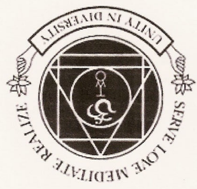
TRUE WORLD ORDER