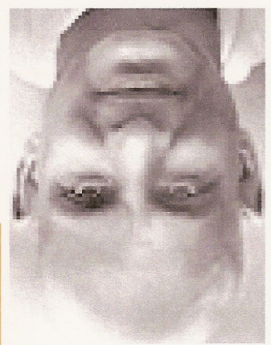
Swami Sivananda 1887-1963